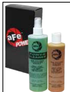
Gold Squeeze Restore Kit