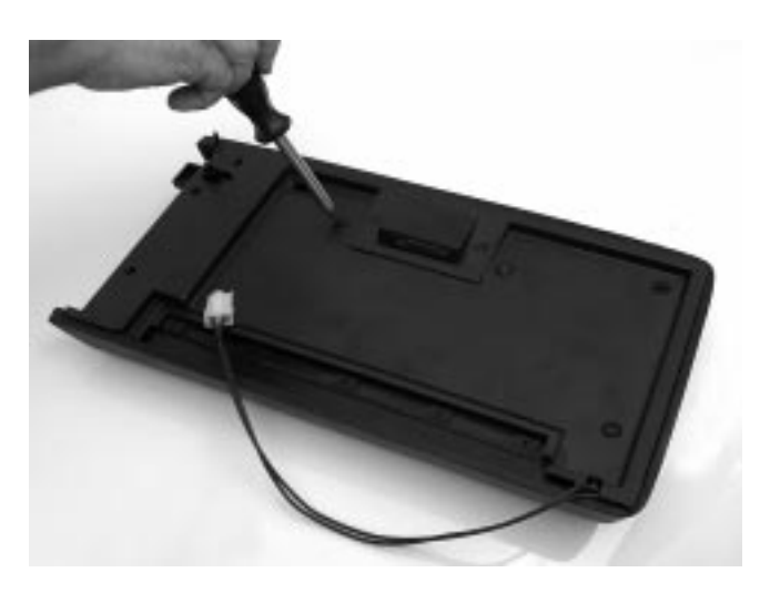
Step 2: Lay console lid face down and remove the screws on the plastic backing plate. (84-89 DO NOT REMOVE the 2 screws that hold the light.) Remove backing plate. (Note direction of console lid spring and button for re-installation.)