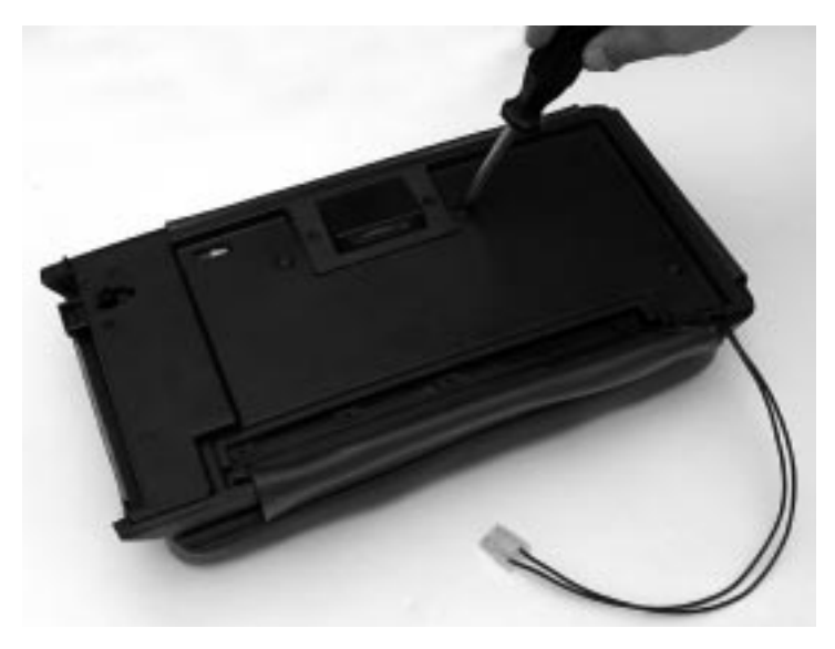
Step 5: Once cushion is aligned and in position re-install backing plate.