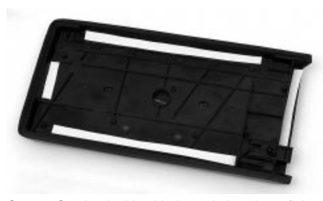
Step 3: Cut the double-sided tape in lengths to fit locations shown in picture. Be sure to clean area thoroughly before applying. You can substitute the double-sided tape with upholstery glue or similar for a firmer hold.