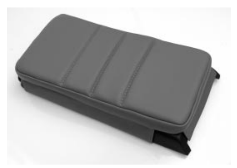
Step 6: Finished!! Re-install console door back to car.